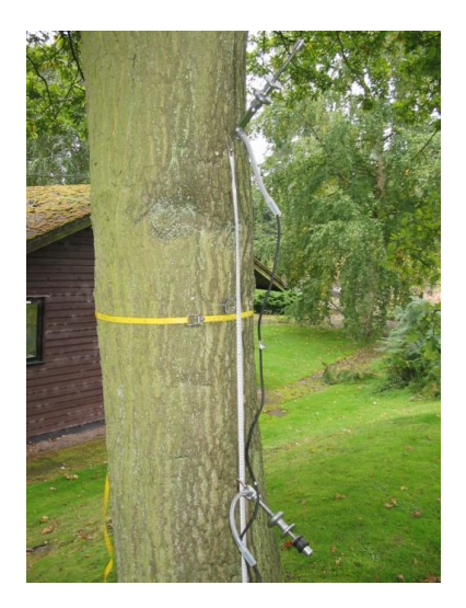
Figure 3. Acoustic tool in use. The picture shows the probes only: the meter that measures the time is out-of-shot.

and then carrying out detailed measurements of the vessels. A quick means of estimating vessel sizes would be a great asset to tree breeders. This study aimed to determine whether measurements of acoustic velocity might discriminate between trees with large vessels and those with small ones.