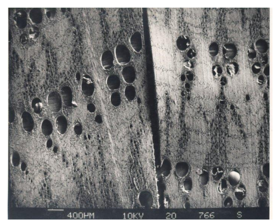
Figure 2. Horizontal sections of oak timber showing a tree with very large early wood vessels (left) and smaller vessels (right)

Oak has very large early wood vessels that can be seen with the naked eye. Some reach 300 \mu m in diameter, or about one third of a millimetre (Figure 2). Savill (1986) found that earlywood vessels with greater diameters than average (say >160 \mu m) predispose wood to shake, in a similar way to bones with large pores being more prone to fracture. The same phenomenon has been found in both corals and concrete, where pieces with larger pores in them are more susceptible to breaking. Vessel size has subsequently been found to be a highly heritable characteristic of oak trees (Kanowski et al. , 1991), so that it is possible to select and breed trees with small vessels to reduce its incidence. This is currently being done by the Future Trees Trust. Large vessels alone will not cause a tree to be shaken. They are, as mentioned above, the predisposing factor. A trigger also has to operate to cause the shake. This could be drought: shake is much more common on drought-prone soils. Wind sway is also thought to be an important factor.