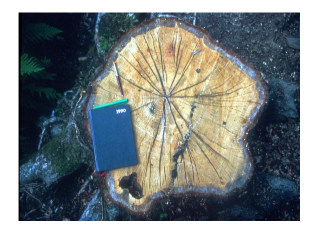
Figure 1. Shaken logs of oak. Left, ring shake, right star shake

Oak has very large early wood vessels that can be seen with the naked eye. Some reach 300 \mu m in diameter, or about one third of a millimetre (Figure 2). Savill (1986) found that earlywood vessels with greater diameters than average (say >160 \mu m) predispose wood to shake, in a similar way to bones with large pores being more prone to fracture. The same phenomenon has been found in both corals and concrete, where pieces with larger pores in them are more susceptible to breaking. Vessel size has subsequently been found to be a highly heritable characteristic of oak trees (Kanowski et al. , 1991), so that it is possible to select and breed trees with small vessels to reduce its incidence. This is currently being done by the Future Trees Trust. Large vessels alone will not cause a tree to be shaken. They are, as mentioned above, the predisposing factor. A trigger also has to operate to cause the shake. This could be drought: shake is much more common on drought-prone soils. Wind sway is also thought to be an important factor.