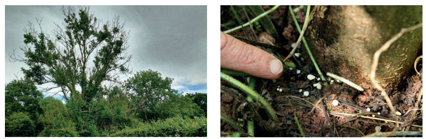
Figure 3. Key indicators of ash dieback. Left: 3a - Susceptible ash tree showing characteristic dead twigs with epicormic growth in the foreground, and uninfected, potentially tolerant ash tree behind. (Photo: ©James Brown, John Innes Centre). Right: 3b - Ascocarp fruiting bodies on last year's rachis. (Photo: Jo Clark)

Any trees that look promising for further research will be grafted on to rootstocks and planted on the public forest estate. In addition, each selected tree will be screened to see if it has markers for tolerance. The resulting archive of tolerant trees will be the focus of monitoring work going forward for several years, with additional trees being added, and those of lower tolerance removed.