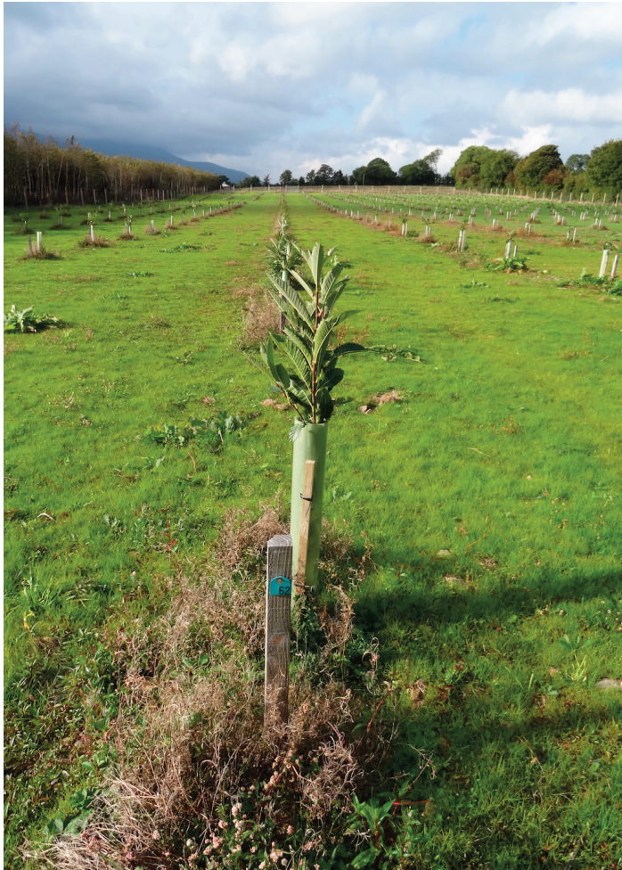
Figure 3. One-year old sweet chestnut clonal seed orchard in Co. Waterford, October 2016.