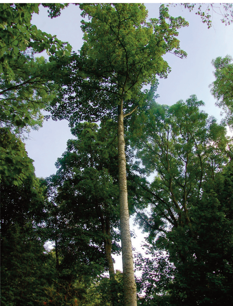
Figure 1. Sycamore plus tree. A dominant individual with high amounts of recoverable timber. (Photo: Jo Clark).

Joseph L. Beesley and Jo Clark review the progress at Future Trees Trust, discuss the opportunities of new broadleaved species and invite readers to identify plus trees and host trial sites.